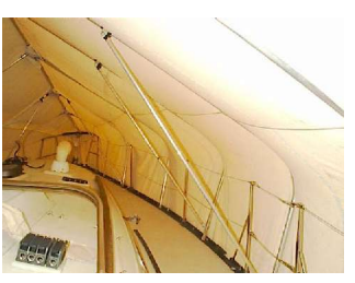
Shows ribs with braces