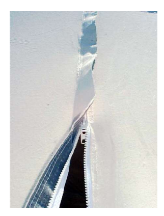
Zipper and flap